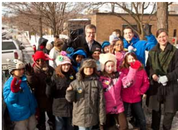
Students participate in a walk-about