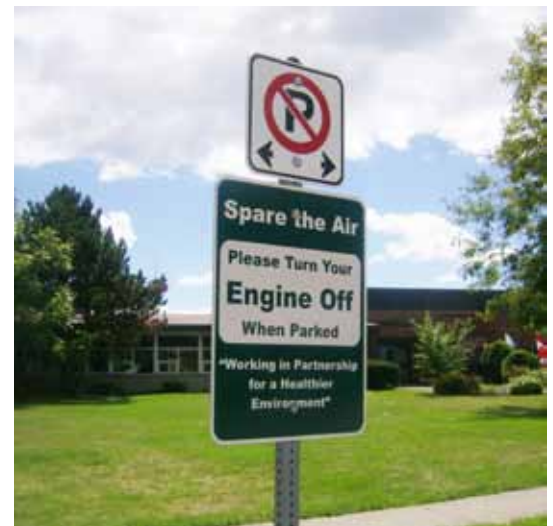
New anti-idling signs posted

Encouragement events such as International Walk to School Day (IWALK) were important contributors to shifting mindsets and transportation behaviour.