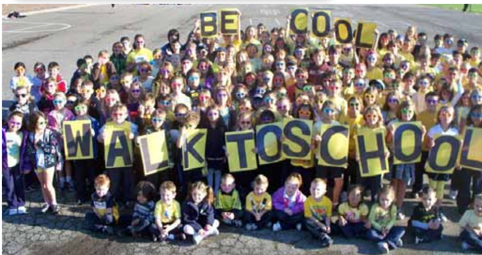
Hamilton students celebrating Wear Yellow Day