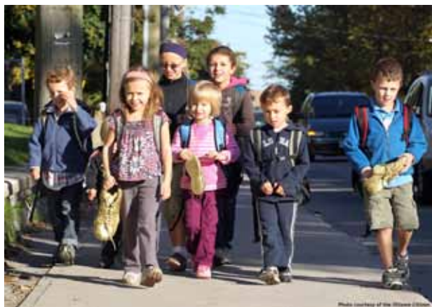
Broadview students celebrate IWALK