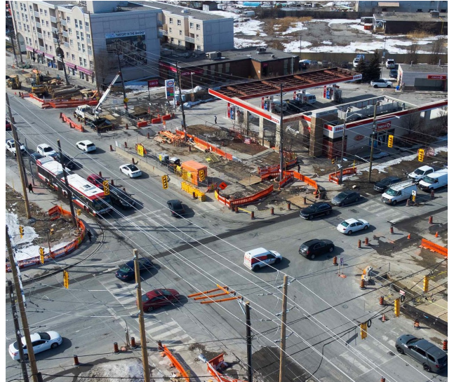
Photo: Intersection of Weston Road and Finch Avenue West.

Virtual Hours of Operation: Monday- Friday, 9:00 a.m. to 5:00 p.m. In person- by appointment. Tel: 416-202-6500