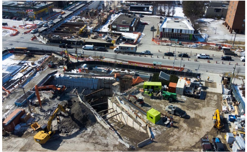
Photo: Pedestrian portal for Finch Station at the intersection of Keele Street and Finch Avenue West.