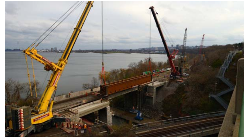
DESJARDINS CANAL BRIDGE EXPANSION