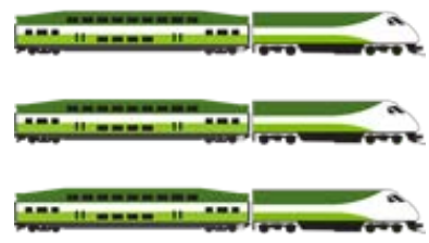
3 new trains

We've made important improvements since 2009 to make the rush hour commute easier and more convenient: