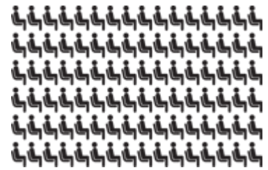
9,000 more seats

We've added 3 new trains, 2 new trips per day, and 9,000 more seats in order to accommodate our customers.