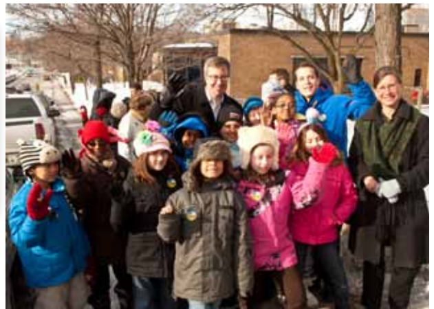
Students participate in a walk-about