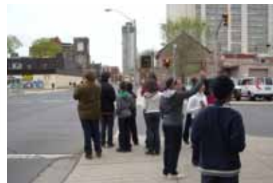
Taking photos of the school journey

Students in Grades 4 to 8, with guidance from adult facilitators, took photos documenting what they saw, heard and smelled on their walk to school.