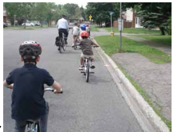
CAN-BIKE instruction on the road →