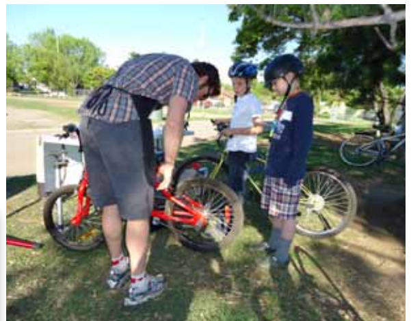
Students check out the bike repair workshop