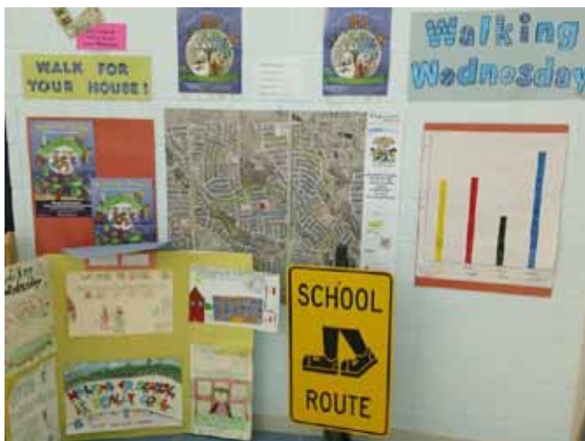
Display showcasing a walking routes map, street sign, and Walking Wednesday participation tracking