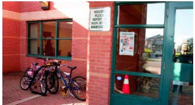
Bikes parked safely by the front office