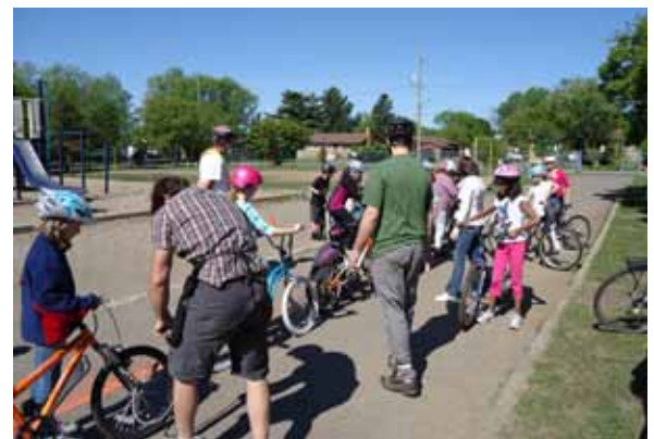
Bike safety training on the school grounds