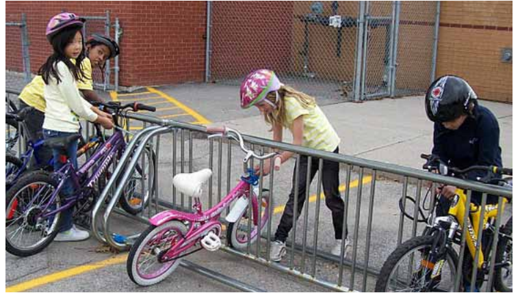
Students try out a new bike rack

Through the Bike Rack Seed Funding Program offered by the City of Hamilton Public Works Department, using funding from the Ministry of Transportation, 16 schools purchased and installed new bike racks. Kids had been locking bikes up on trees etc. so having the new bike racks improved safety.