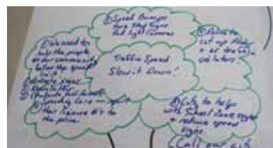
Brainstorming solutions for issues identified

Students from all three schools came together in a seminar to share experiences and brainstorm solutions to the issues raised.