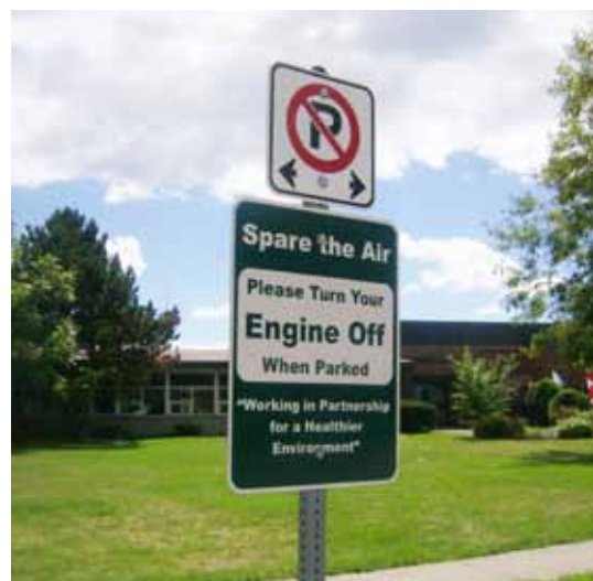
New anti-idling signs posted

Encouragement events such as International Walk to School Day (IWALK) were important contributors to shifting mindsets and transportation behaviour.