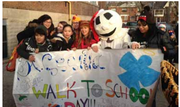
Students are enthusiastic about Walk to School Day