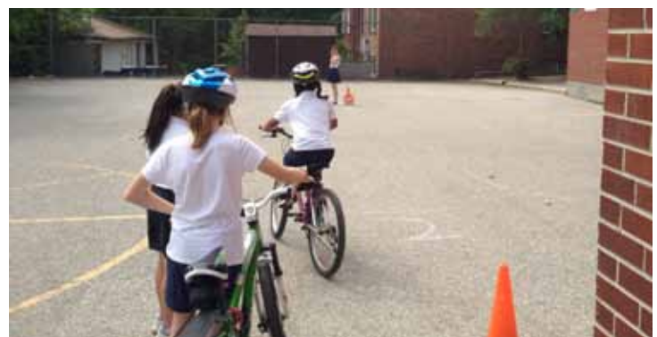
Students practice their cycling skills