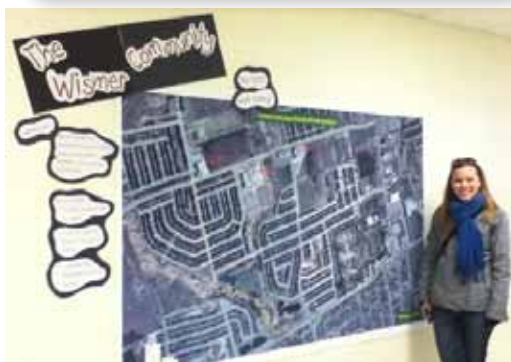
Large map of school catchment area

"It would be amazing to do a car count today! We have NO traffic anymore." From York Region School Travel Plan - Pilot Project Report 2010-2011