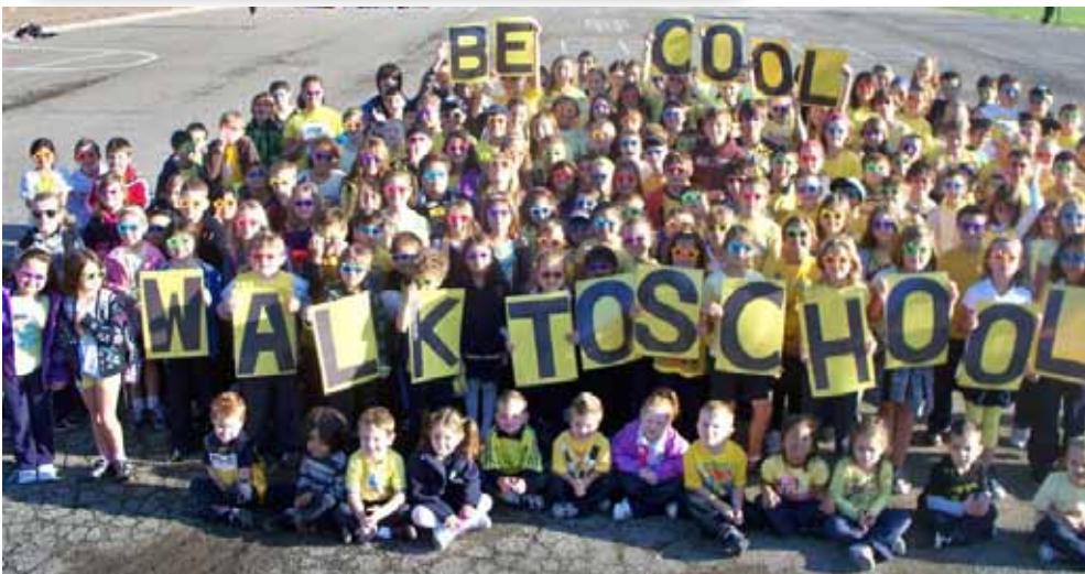
Hamilton students celebrating Wear Yellow Day