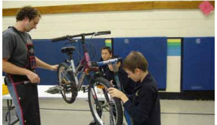
A bike repair workshop