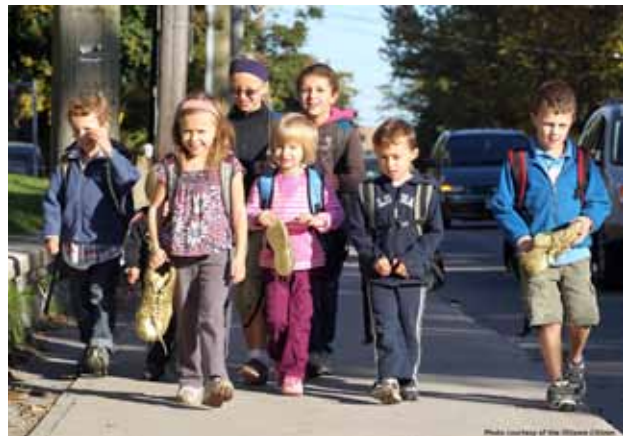
Broadview students celebrate IWALK