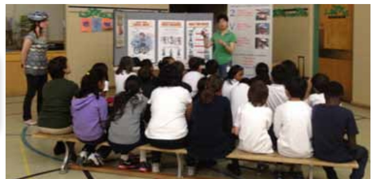
Students learn about cycling safety