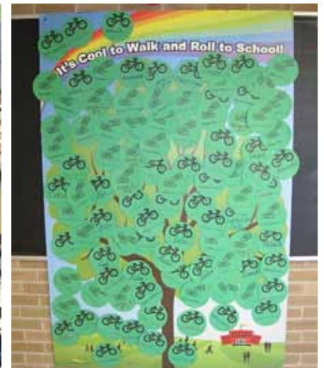
An active transportation tree