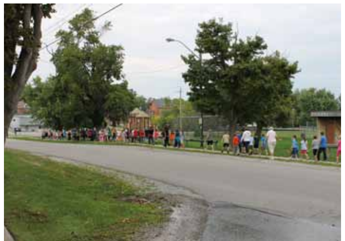
Students take a walk around the school neighbourhood