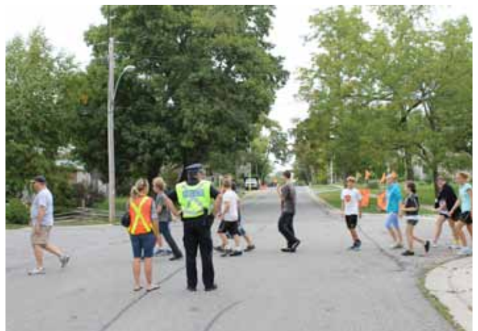
Police provide support