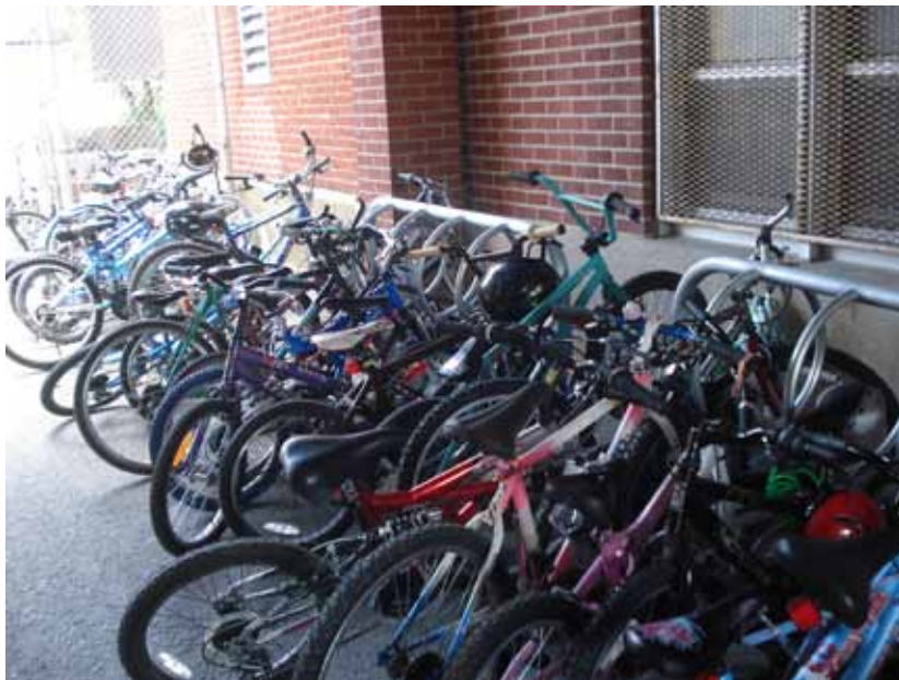
↑ Well-utilized bike racks show the enthusiasm for cycling to school in Ottawa