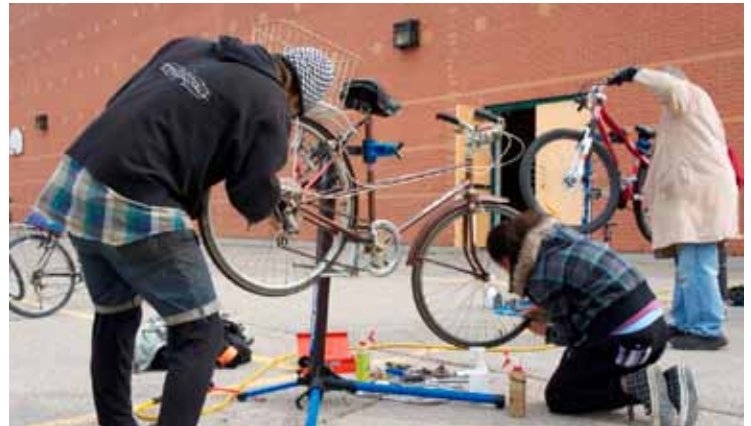
Students have their bikes inspected by a mechanic

After working on raising awareness among school personnel, students and parents, Waterloo Region's stakeholder group realized that winning over individual school champions was not translating into sustainability from one year to the next. Buy-in was needed from the top and on a systemic level, so an Active Transportation Charter for school boards was developed by the stakeholder group to guide future policy development. The Charter was unanimously adopted in May 2011 by both school boards. Beyond the Charter, strategic next steps are being planned and work is underway to create a full-time STP Coordinator position. The Charter is available at: www.wrdsb.ca/planning/files/2012/04/Active-Transportation-Charter_WRDSB-only.pdf .